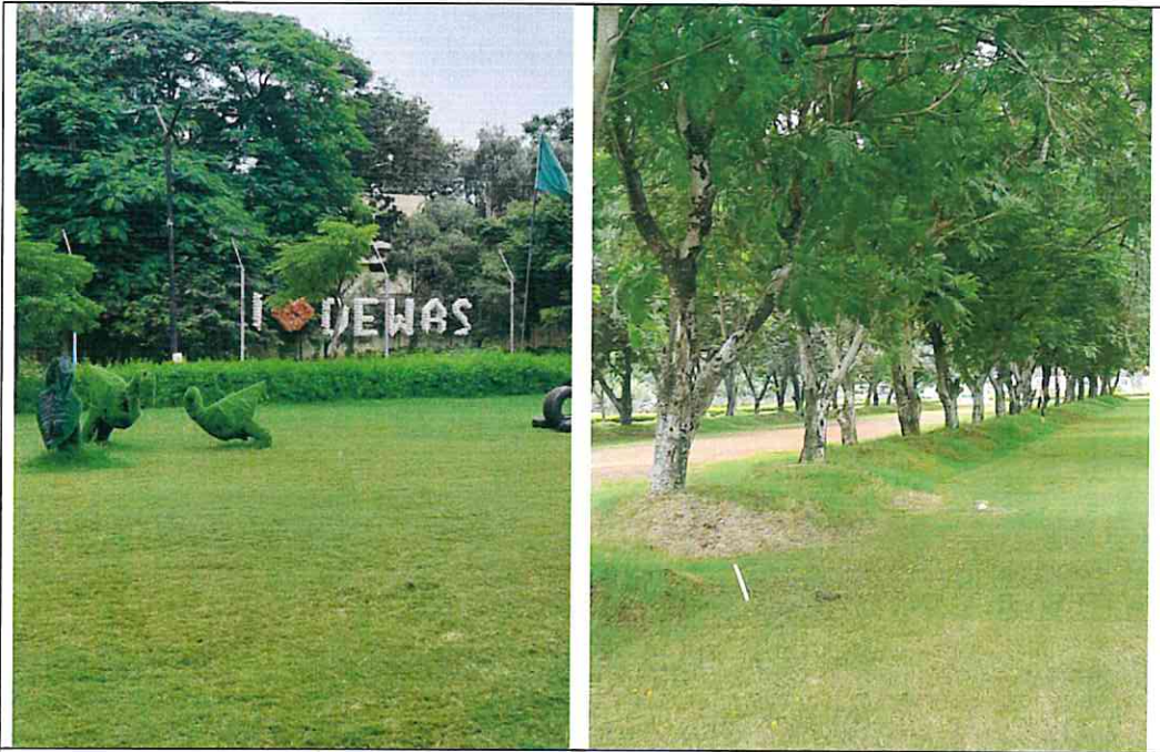
Manicured shrubs and Greenery in park