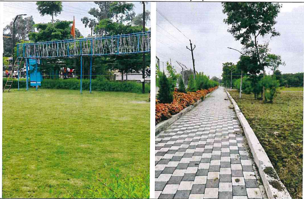
Well maintained pathways