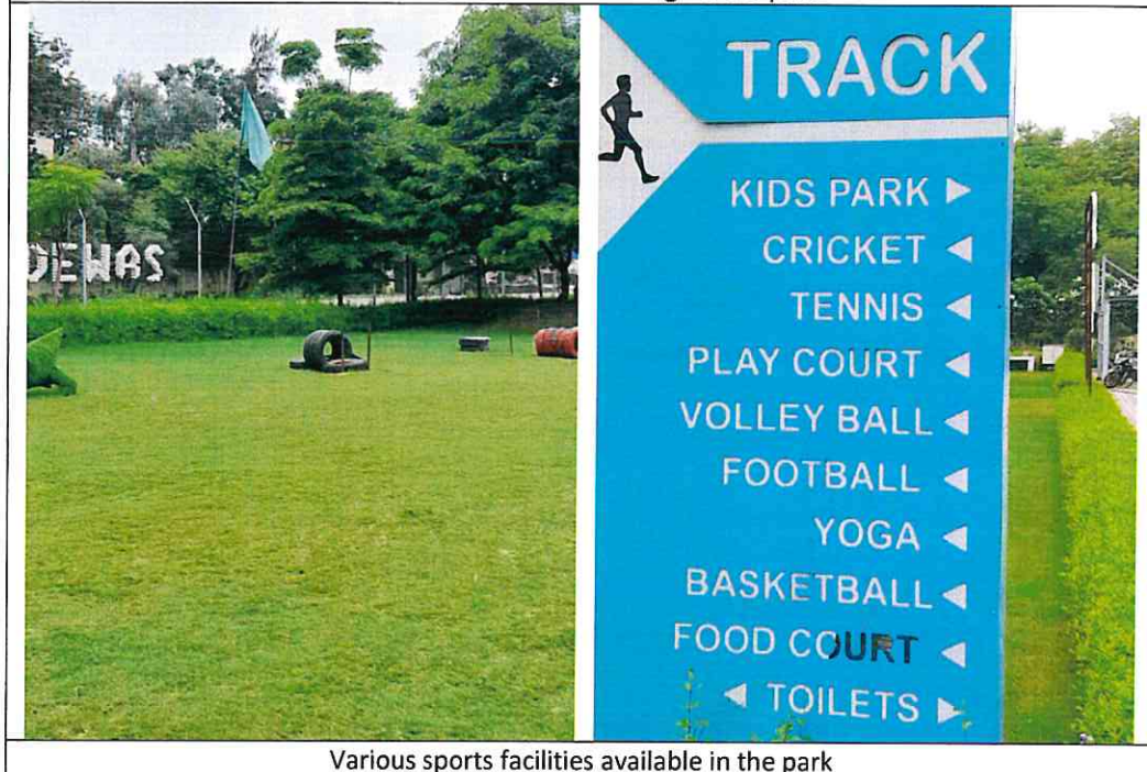
Various sports facilities available in the park