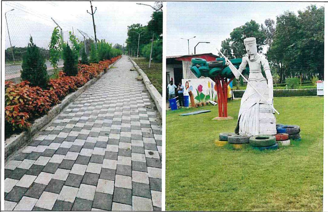
Well maintained pathways and attractive monuments