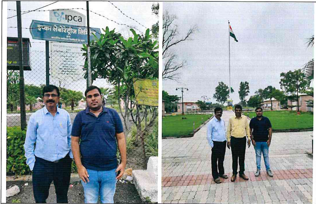
IPCA and NPCO team during visit to park