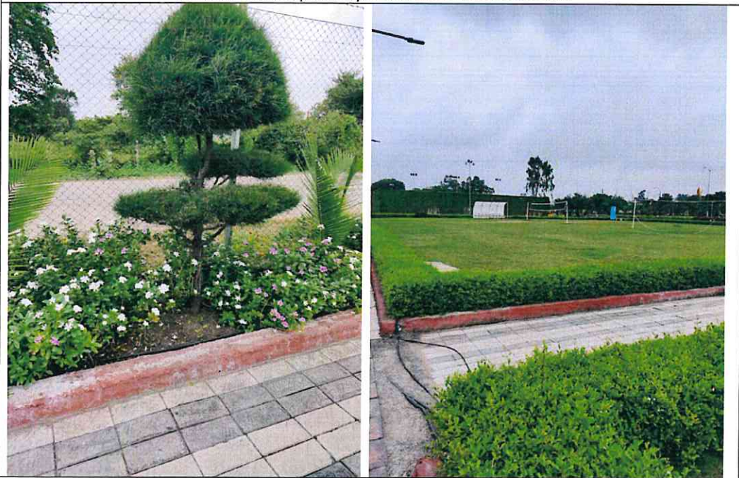
Playground to encourage physical fitness