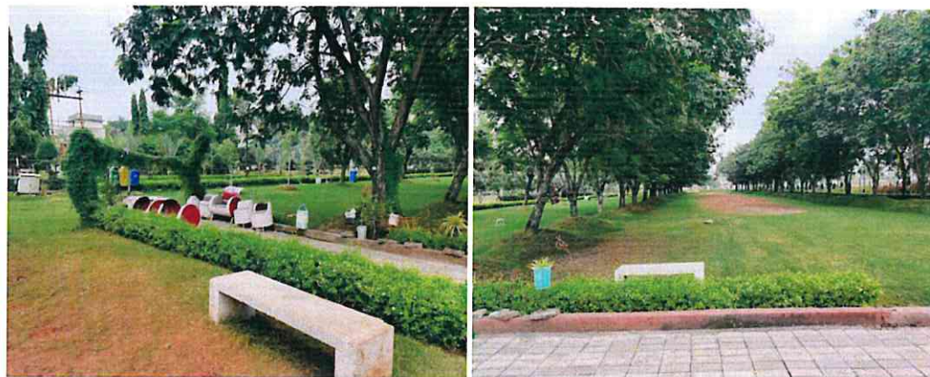
Running track with greenery and flora and fauna