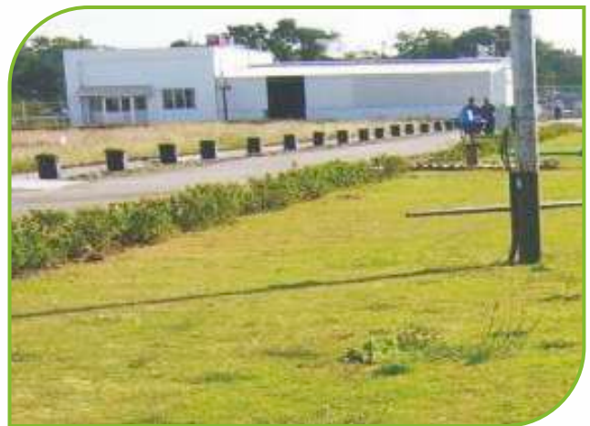
Water used to maintain greenery