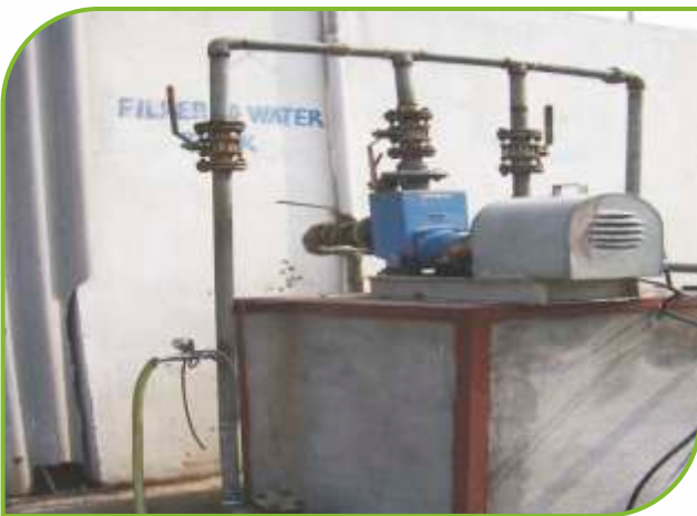
Effluent Treatment Plant' (ETP), Pithampur

Water being a dynamic resource requires its effective utilization and prevention. Taking a step ahead, manufacturing plant at Pithampur has installed an 'Effluent Treatment Plant' (ETP) for treating the waste water generated at the factory. This treated water is further used for gardening and plantation purpose within the factory premises. This activity has helped to prevent water pollution; waste-water is being utilized and has attained a Zero Discharge title.