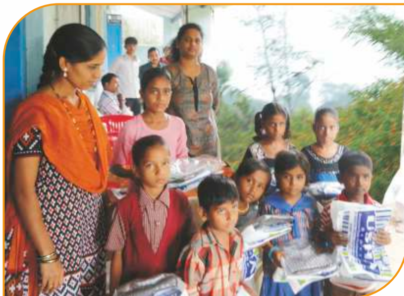
School children with stationery item