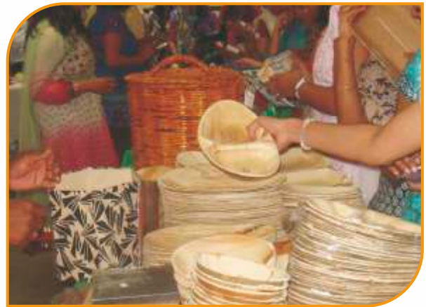
Handmade eco-friendly products

Supporting the drive and to promote the usage of eco-friendly products, Ipca organized an exhibition, which displayed such products. Employees too participated in this event as customers of the exhibition.