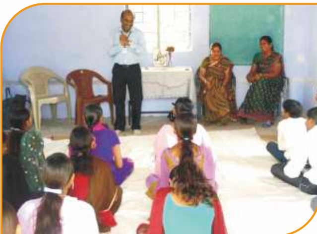
Students attending the seminar