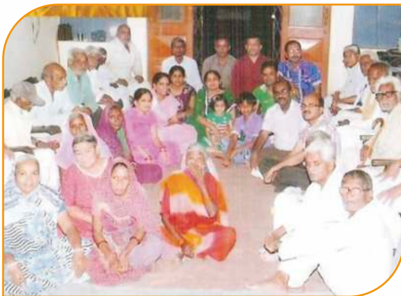
Ipcas with elderly people

Ipcas - Ratlam extended its compassion and support to the elderly people by conducting a programme 'Ek Sham Vrydho Ke Naam' in March 2012. The employees visited the old age home and spent an entire evening; also, meals were sponsored for the elderly to relish.